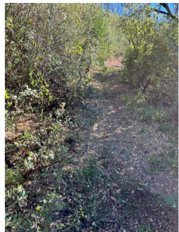
Figure 4 - Motorcycle Trail after trail brushing work completed with OHV grant funds.