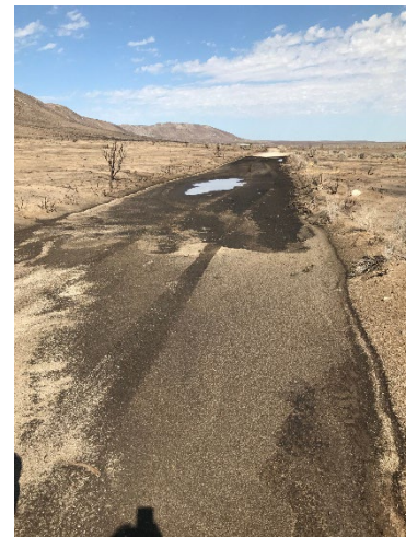
Figure 2 - After the 2020 Laura fire.

The Eagle Lake Field Office (ELFO) recreation staff will commence Stage 2 development 1 of the Widowmaker Trailhead, following the damage caused by the 2020 Laura fire, which swept through the existing OHV staging area. Beginning in late October 2025, developments will feature several key enhancements, including the installation of two shade structures with a BBQ, table and fire ring, in addition to an interpretive sign, a double vault toilet, and strategic boulder placements around the trailhead and facilities. Additionally, we will construct approximately 0.10 miles of the Widowmaker trailhead green sticker road and expand the staging area by 0.30 acres in sections where native soil is present. Activities will consist of grading, graveling, compacting, and watering to ensure a durable and enjoyable space for off-highway vehicle visitors.